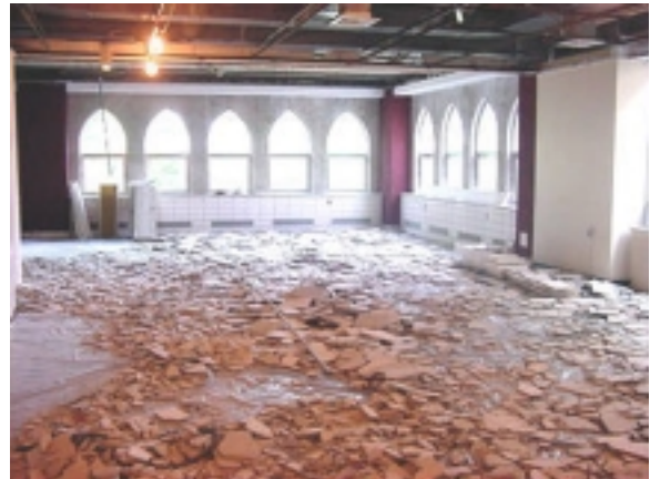
Drexel Library second floor demolition phase

Phase II of the Library plan includes a long-awaited upgrading of the heating and cooling systems and the renovation of the Curriculum Materials Center into a multi-use space for guest speakers and special events. We also plan to add additional compact shelving for collection growth and create expansion space for the University Archives and special collections.