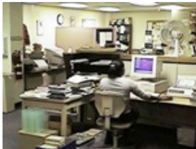
The mysterious "back room" of the Drexel Library

These databases are available via the Web for off-campus use but you will need to configure your browser for the campus proxy server and log in with your campus network account name and password. Instructions for this are at the top of our Databases Web page at the URL listed above.