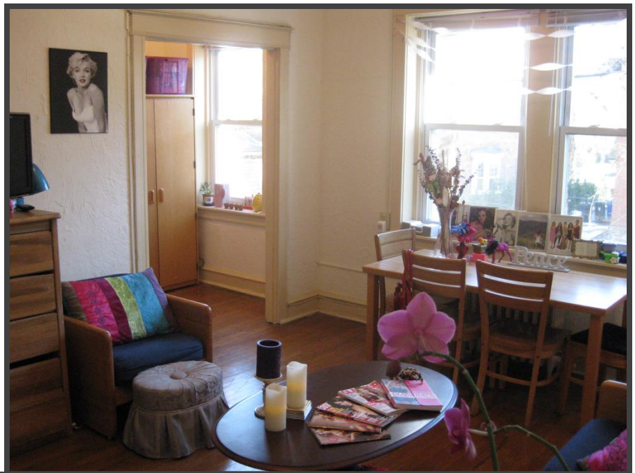
Sample Living/Dining Room

Individual apartment layouts vary by unit.